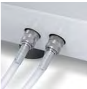
quick release connector

The large integrated funnel-shaped opening of the water storage tank makes it easy to fill the tank with demineralized or distilled water in the Euroklav® 23 S+, 23 VS+ and 29 VS+. Alternatively, both autoclaves could be fed the required water supply from any external reserve vessel or even be connected to a water-treatment unit.