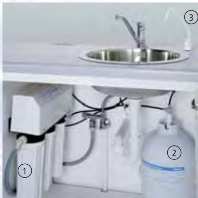
MELAdem®47 (1) installed in a sub cabinet with water tank (2) and additional tap (3).