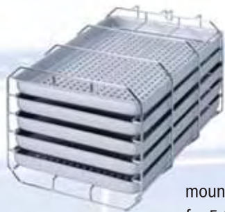
mounting „A“ for 5 trays

The autoclaves are always delivered with a mounting for trays or cassettes, included in the price, with the standard combined mounting "A" (for 5 trays or 3 standard tray cassettes). The optional package holder allows the vertical sterilization of sealed items for optimal drying results.