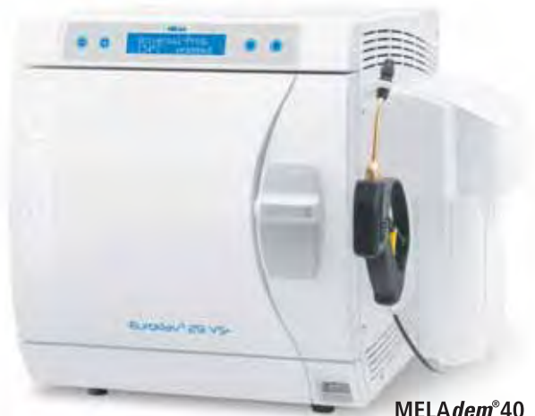
MELAdem® 40 mounted on the Euroklav® 29 VS+

Operating the autoclaves should be both pleasurable and safe. The design fully supports this demand. It shows what's essential, and does its work efficiently. The large door lock is not only a design feature, but also ensures a safe and easy opening and closing of the door.