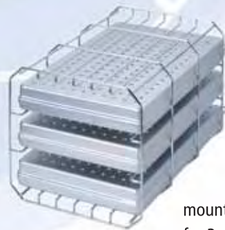
mounting „A“ (rotated) for 3 standard tray cassettes