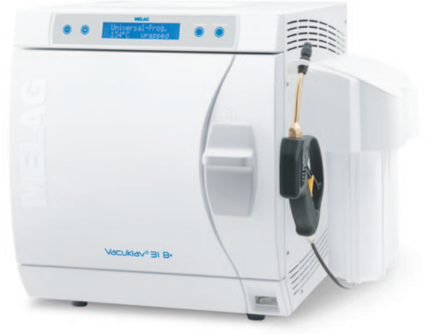
MELAdem®40 mounted on the Vacuklav® 31 B+

Operating the autoclaves should be both pleasurable and safe. The design fully supports this demand. It shows what's essential, and does its work efficiently. The large door lock is not only a design feature, but also ensures a safe and easy opening and closing of the door.