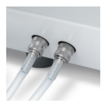
quick release connector

The large integrated funnel-shaped opening of the water storage tank makes it easy to fill the tank with demineralized or distilled water in the Vacuklav<sup>®</sup> 31 B+ and Vacuklav<sup>®</sup> 23 B+. Alternatively, both autoclaves could be fed the required water supply from any external reserve container or even be connected to a water treatment unit.